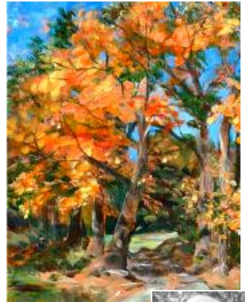
"Fall's Glory at Parlees"