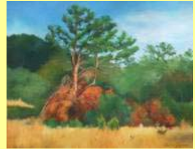
"Green Belt - Gloucester" – acrylic painting by Claire Gagnon

Claire Gagnon Exhibit April 2 – April 30 th