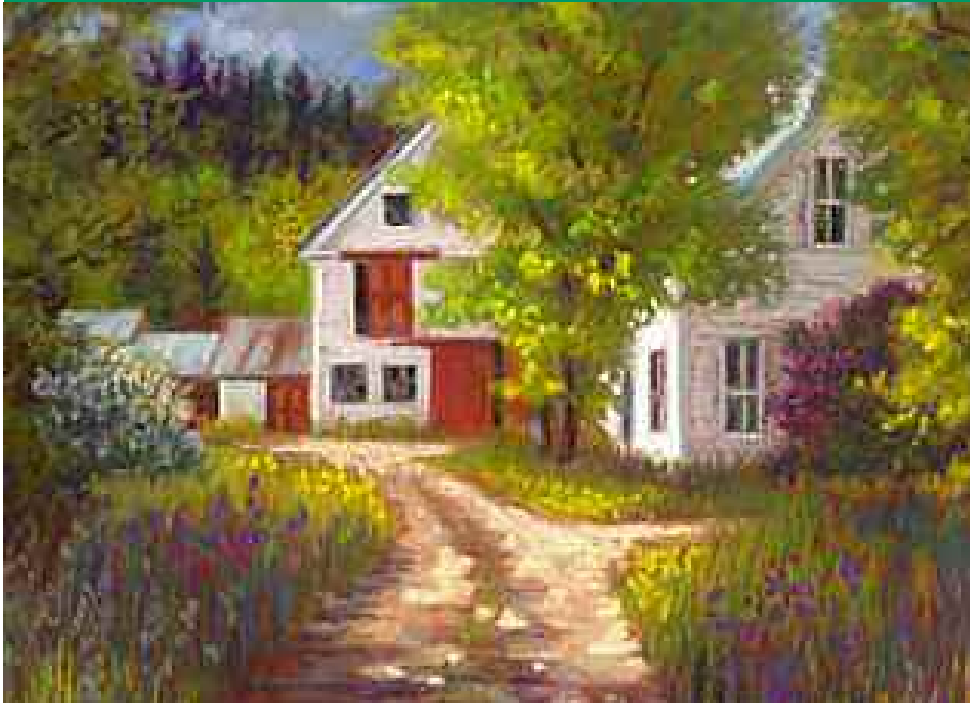
"New England Farmhouse Cold Spring Farm " by Nita Casey