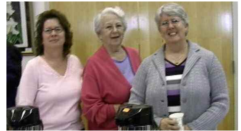
At the library show, our Hospitality board members helped to organize and provide a wonderful assortment of refreshments.

The selected pieces will soon be photographed and the calendar will be for sale at the 4 th of July Art Festival.