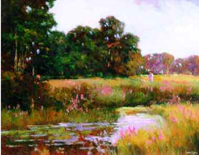
"By the Pond" by Monique Sakellarios

REMINDER: Pick up dates for the Library Show on Jan 29 th , 30 th and 31 st . Sign out at library desk.