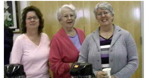
At the library show, our Hospitality board members helped to organize and provide a wonderful assortment of refreshments.

The selected pieces will soon be photographed and the calendar will be for sale at the 4 th of July Art Festival.