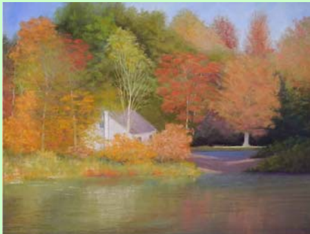
"Fall Pond" pastel painting by Carol Conrad

The Town Offices 50 Billerica Road, Chelmsford: