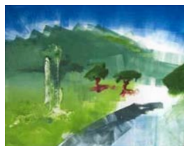
Romanesque

Everyone welcome. For information: 978.251.3971.