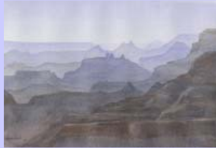
"Grand Canyon" by Esther Donlon

The Summer Place 20 Summer Street, Chelmsford: