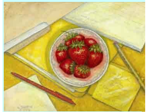
"Strawberry Surprise" by Nan Quintin

Start painting now and register by June 16 to pay the lower fee!! See the attached application.