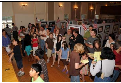
Waiting for Awards