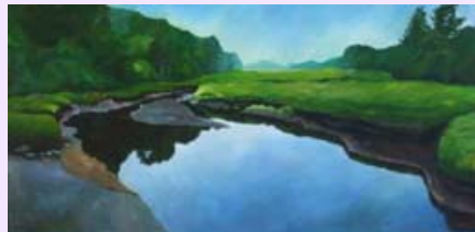
"Essex Creek" by Claire Gagnon

Claire Gagnon is exhibiting her show "New England Impression" at the Sapient Gallery, 131 Dartmouth St., 3 rd floor, Boston, MA 02116 This show will run until Sept. 30, 2009.