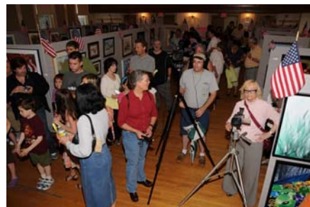
Waiting for Awards